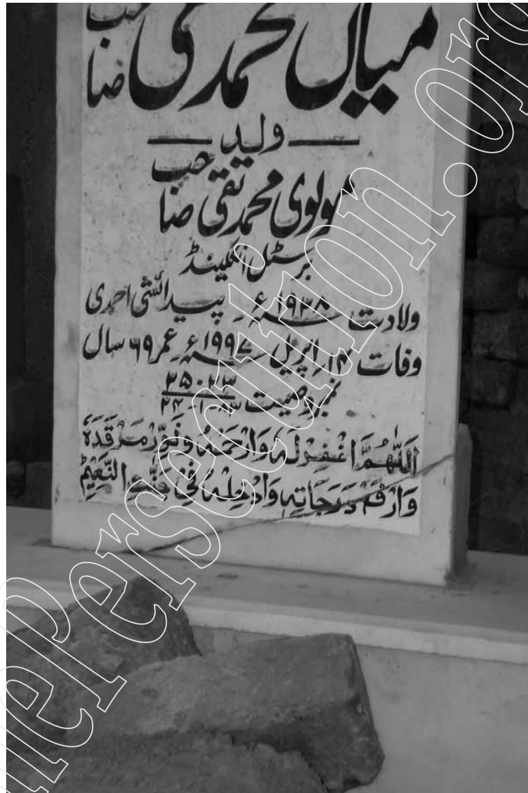
Repair following damage to headstone in Ahmadi cemetery.