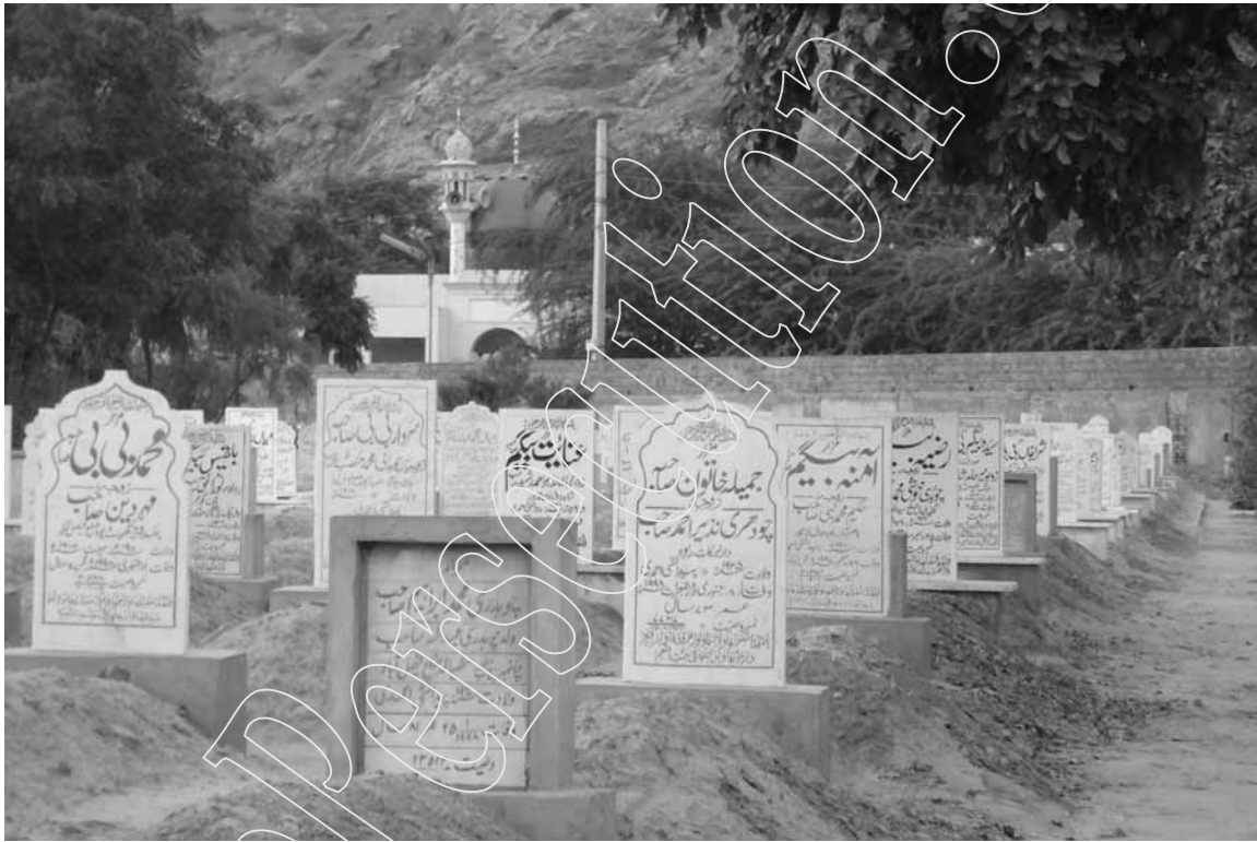
Location of Mullah Arshad's Khatme Nabuwwat mosque adjacent to Ahmadi cemetery, Rabwah.