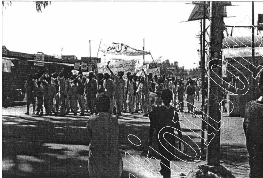
March through Rabwah