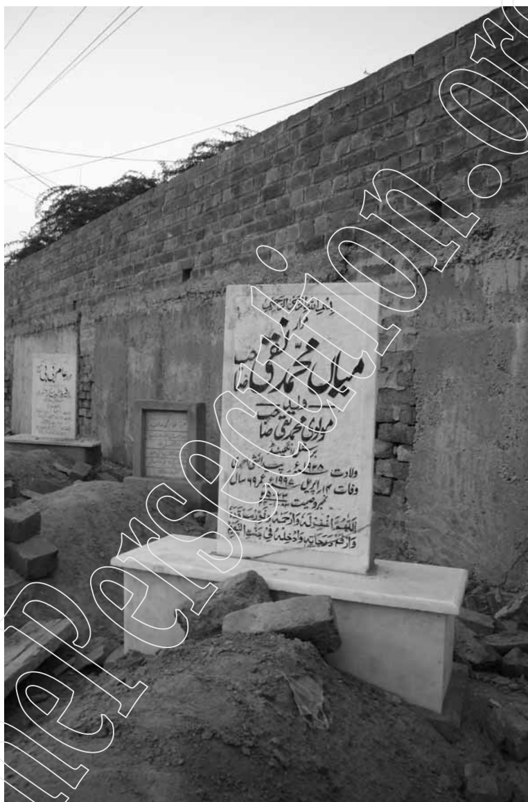
Location of repaired headstone next to the wall forming a boundary with Mullah Arshad's Khatme Nabuwwat mosque.