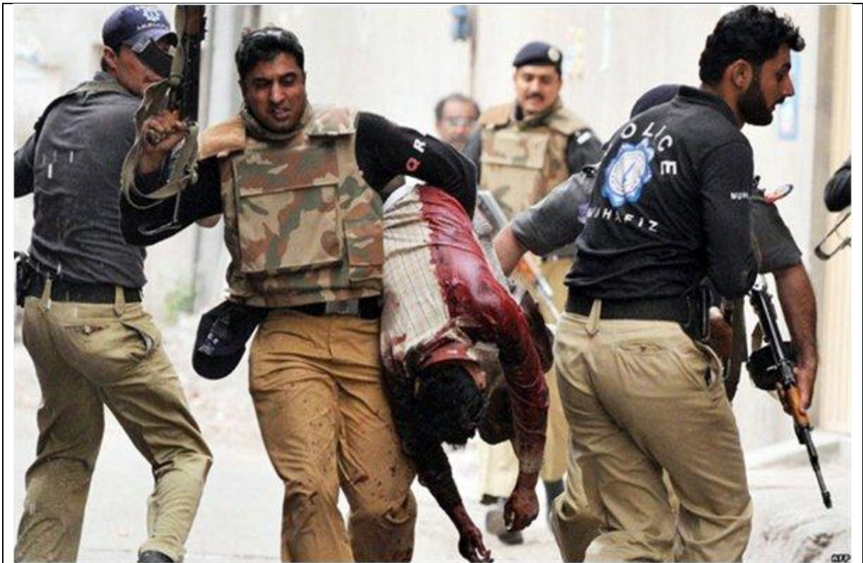
A scene from the deadly attack on Ahmadis in Lahore