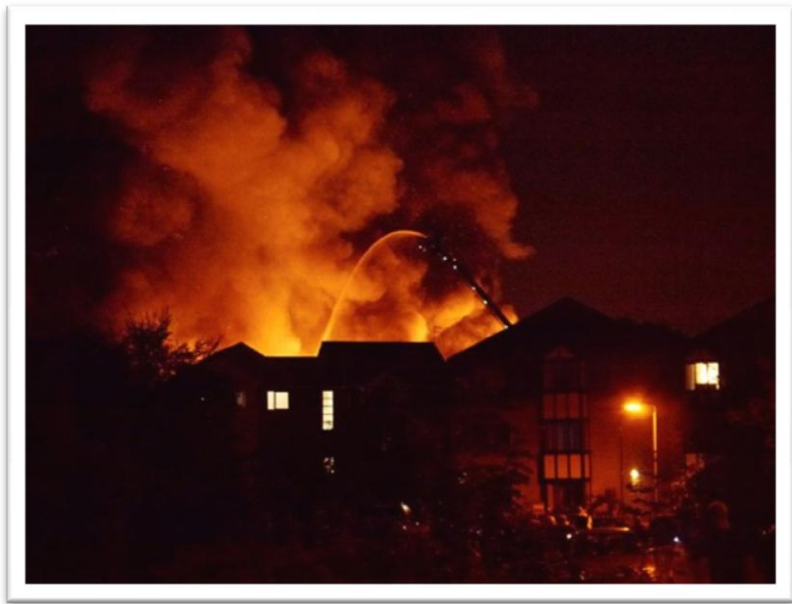
Another scene of the factory on fire

The daily The Nation of November 22, 2015 made editorial comment on this 'Mob Justice': "... With Ahmadis declared non-Muslims by the Pakistani government in 1974, there is no stopping the public in trying to make them feel like they do not belong to this country. Eleven member of the sect were murdered for their faith in 2014 and authorities failed to apprehend any of the killers. ... "Severe action will be taken against the culprits," Nisar (Interior Minister) added. But these words mean nothing as such attacks against Ahmadis have become a norm. No official account has ever been given about the perpetrators, backers, financiers or masterminds of these heinous crimes."