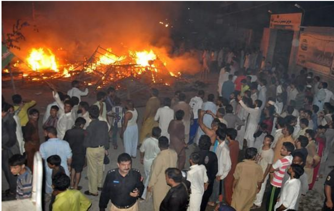
A scene of the riot. Punjab Police officials in foreground can be seen at peace and harmony with the mob