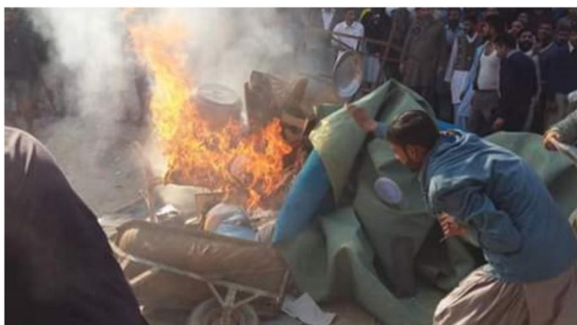
Mosque's furnishings set on fire

Chenab Nagar, Rabwah (PR): Miscreants attacked an Ahmadi place of worship in Kala Gujran, Jhelum. They damaged the furnishings, took them out in the street, and set them on fire. Three days ago, on November 20, the opponents of the Ahmadiyya community attacked a chip-board factory and set it ablaze when people were still inside. The perpetrators acted to burn alive those inside the factory. Their lives were barely saved with