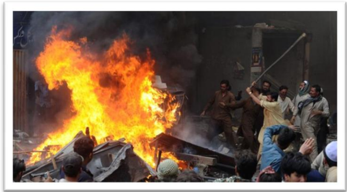
Arsonists at the scene of arson

According to the daily The News: By evening, announcements were made from local mosques that the owner and the workers had burnt the Quran. Soon, outrage spread in the nearby villages. Following this the people not only from the vicinity but nearby villages gathered as a mob and set ablaze the chipboard factory. The houses and the offices of the factory were destroyed, looted and burnt. ...The DPO says announcements were made in the nearby villages urging people to gather outside the factory, and possibility of any mischief cannot be ignored.