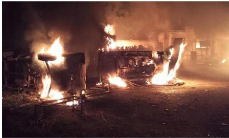
Vehicles on fire in the factory

Arson attack by a mob on an Ahmadi-owned chipboard factory in Jhelum (Punjab) was in a way the major anti-Ahmadi incident of 2015. The attack was apparently a reaction of a crowd to an alleged accusation of defiling the Quran, but there is evidence that it was pre-meditated and planned. The sizable factory was nearly 70% destroyed. Ahmadis' homes located insides the parameters of the factory were first looted and then set on fire, with no regard to the lives of the families inside; all of them had to flee to save their lives. Apparently there was no SOP with authorities to meet such a situation and adequate police force was not available. Army units had to be deployed to restore law and order. The next day, the bigots chose to target an Ahmadiyya mosque