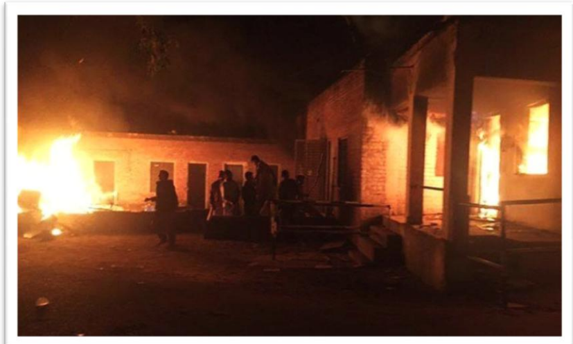
Factory building ablaze