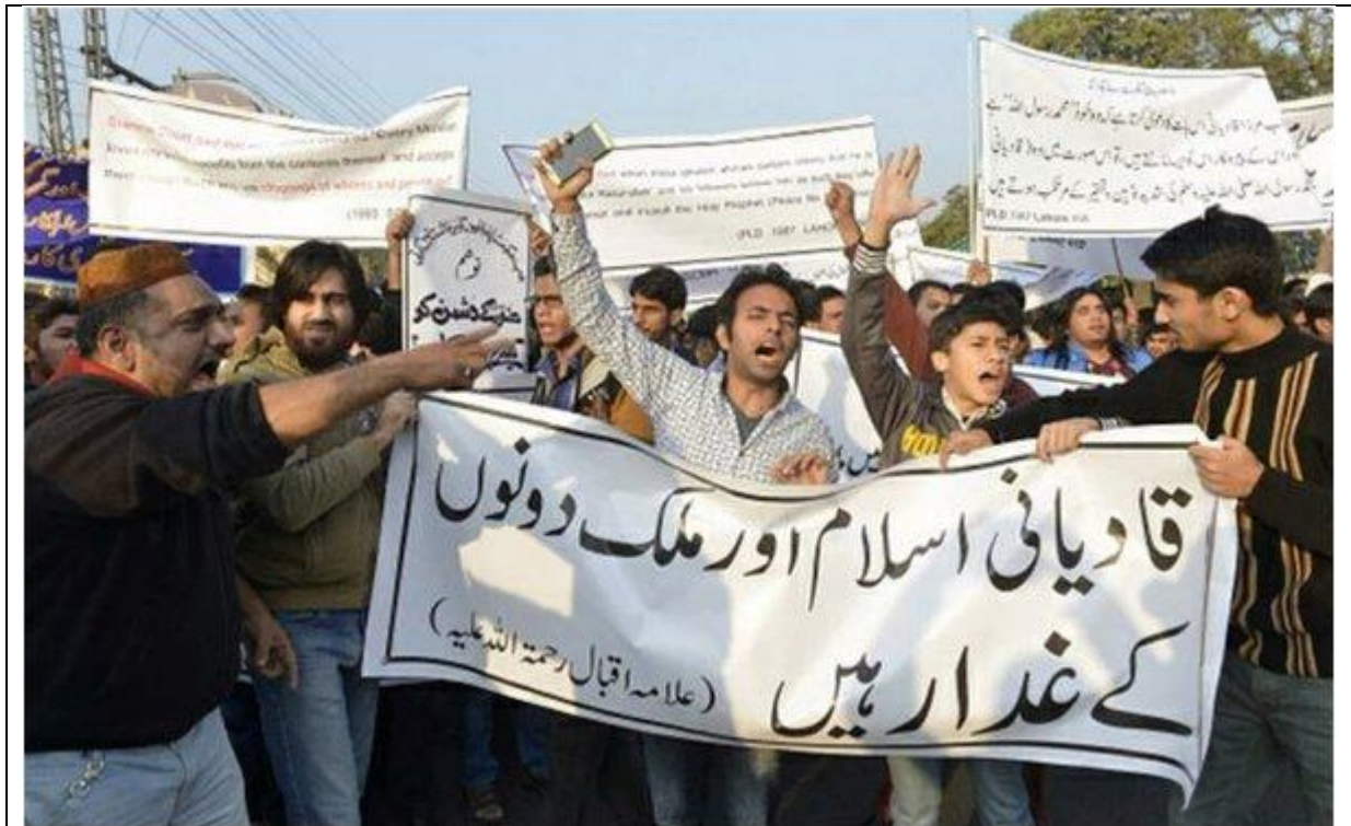
Bigotry on the streets of Lahore – targeting Ahmadis