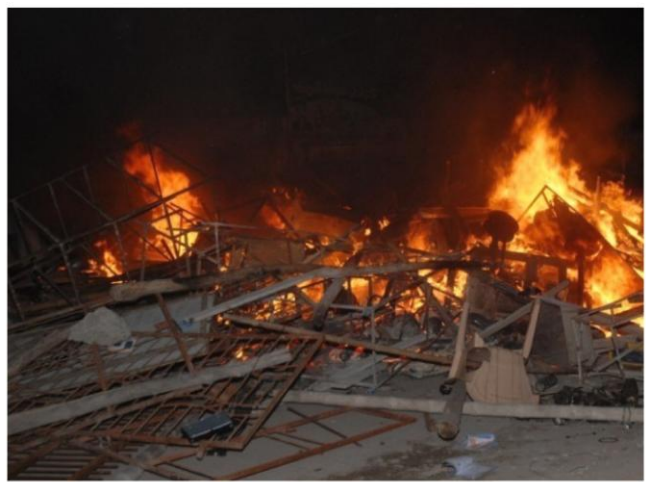
Arson attack in Gujranwala