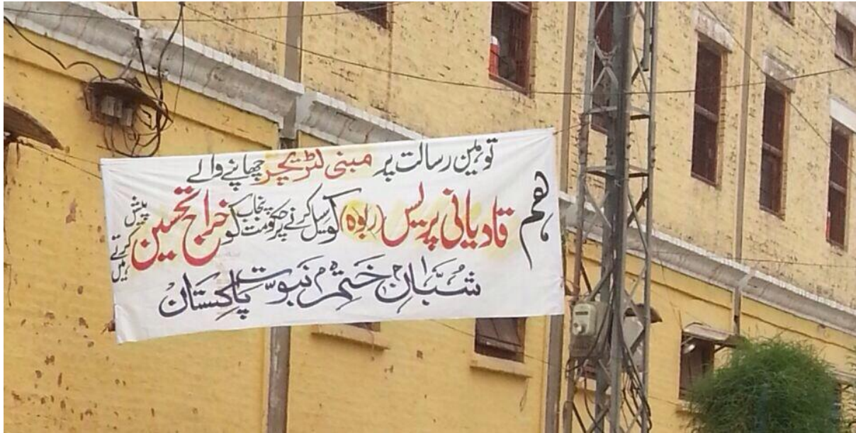
The banner displayed in Chiniot

As expected, the bigoted brigade was overjoyed by the WARNING and orders issued by the government. The Majlis Ahrar Islam of 1953 notoriety issued a special bulletin repeating the WARNING but listed only the Ahmadiyya publications out of the 150 on the list. The Shubbane Khatme Nabuwat of the same ilk hung banners in bazaars with statements that openly and unambiguously promoted 'feelings of enmity or hatred between classes of the citizens of Pakistan': 'We pay compliments to the Government of the Punjab for sealing the Qadiani Press in Rabwah that prints blasphemous literature.' This is criminal lie and slander.