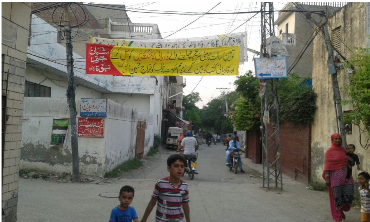
A banner in Rahmanpura, Lahore by Shuban Khatme Nabuwwat praising the Government of Punjab for 'sealing Qadiani press and banning Qadiani books'.

Continued denial of this prayer centre to Ahmadis is noteworthy. Where should Ahmadis go to worship?