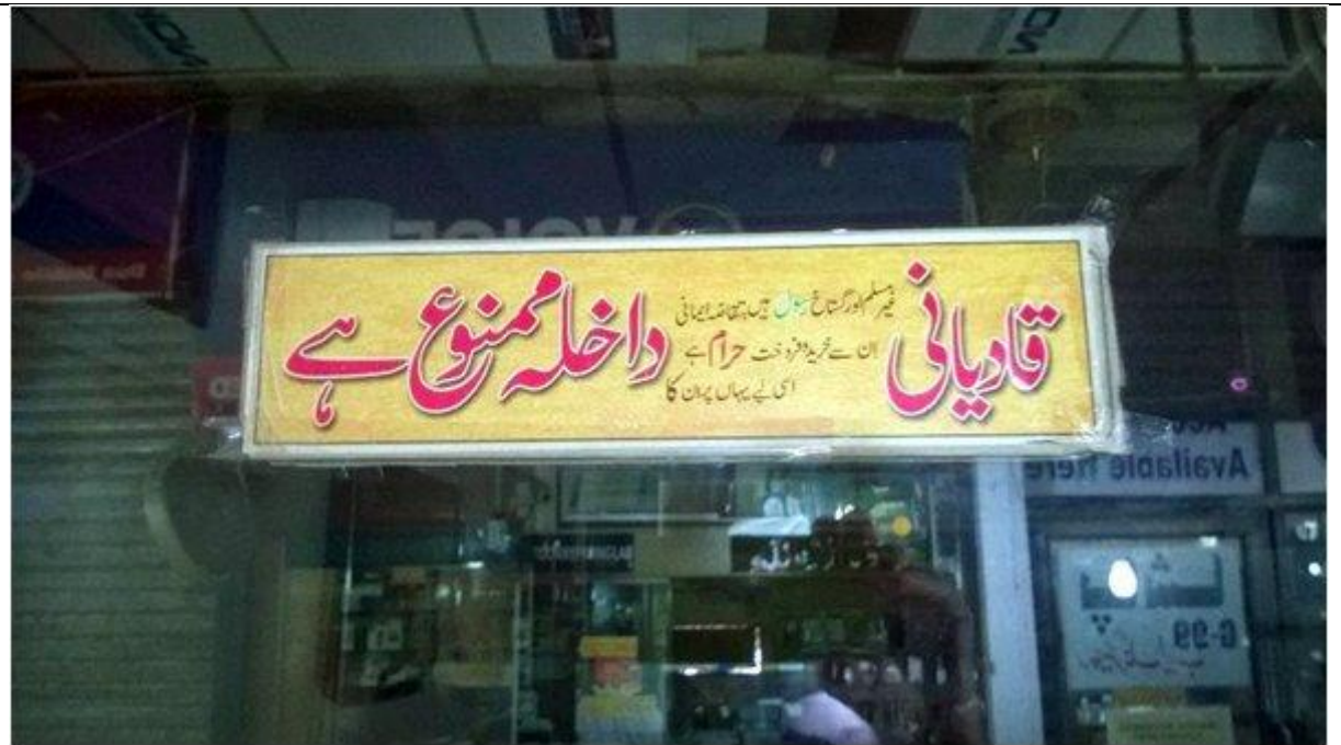
Discrimination against Ahmadis in Pakistan – institutionalized and commonplace “Qadianis are forbidden to enter here.” ( The Friday Times, Lahore; December 11-17, 2015 )