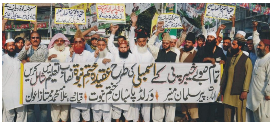
Following KPK all provinces should include dogma of Khatme Nabuwwat in education syllabi: Demand in a rally by World Pasban Khatme Nabuwwat