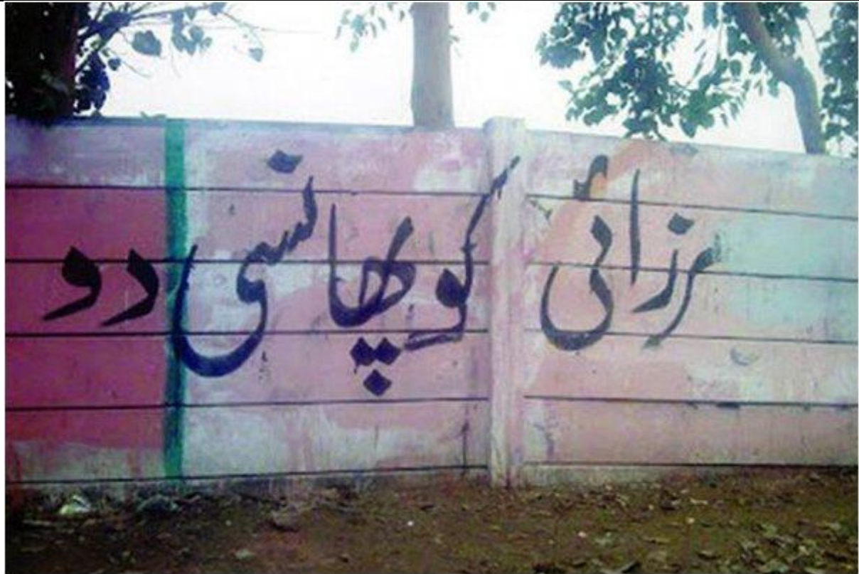
'Hang the Ahmadi' written on a wall

The Friday Times, Lahore; December 11-17, 2015