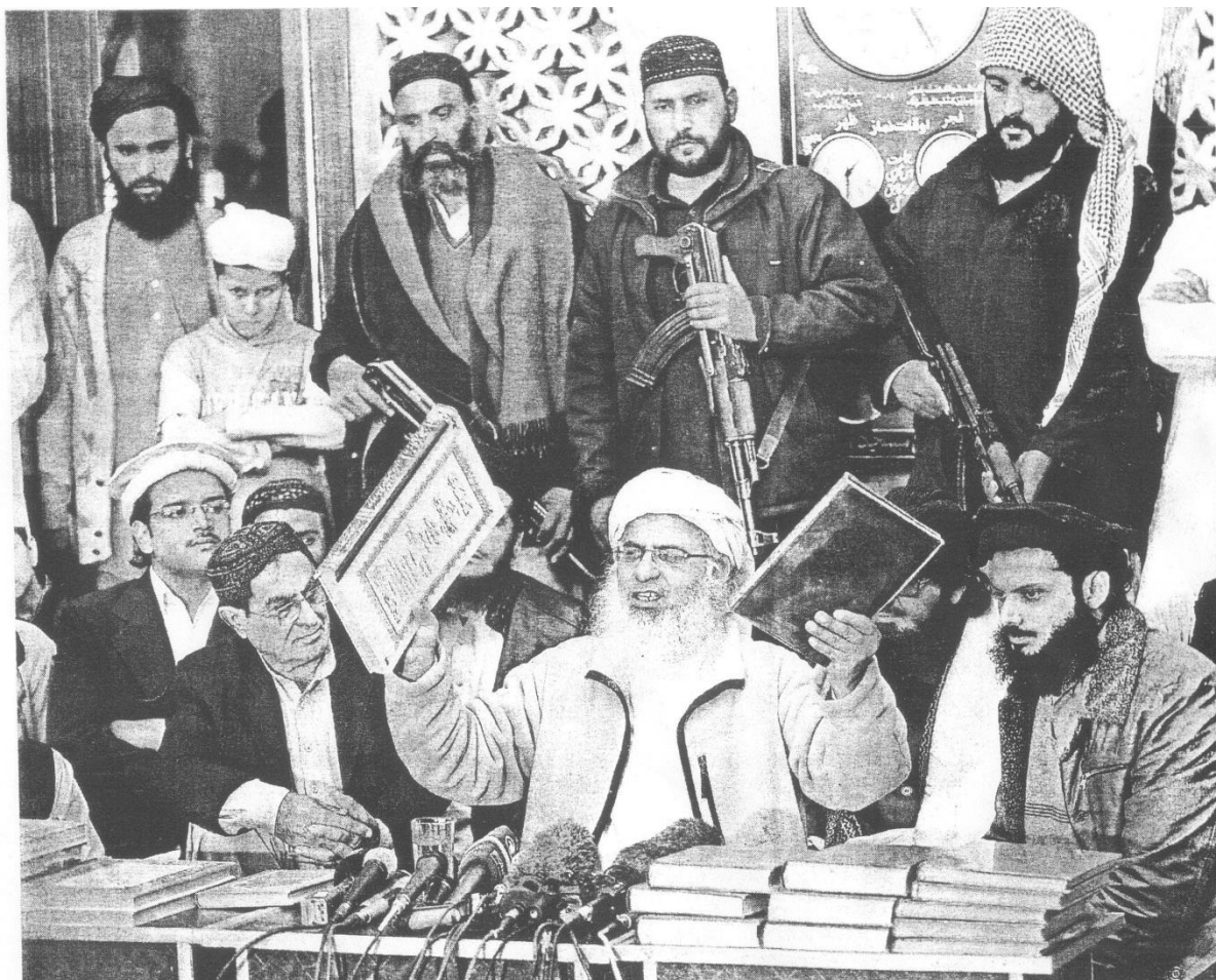
Maulana Abdul Aziz, center, the radical preacher of the Red Mosque in Islamabad. The government limits his actions, but girls at a school attached to the mosque praised the Islamic State.

Islamabad; November 16, 2015: The prestigious daily Dawn published an editorial, titled: Lal Masjid memories. The editorial takes notice of the latest announcement by Maulvi Abdul Aziz of a campaign for the ‘implementation of Sharia’ in Pakistan.