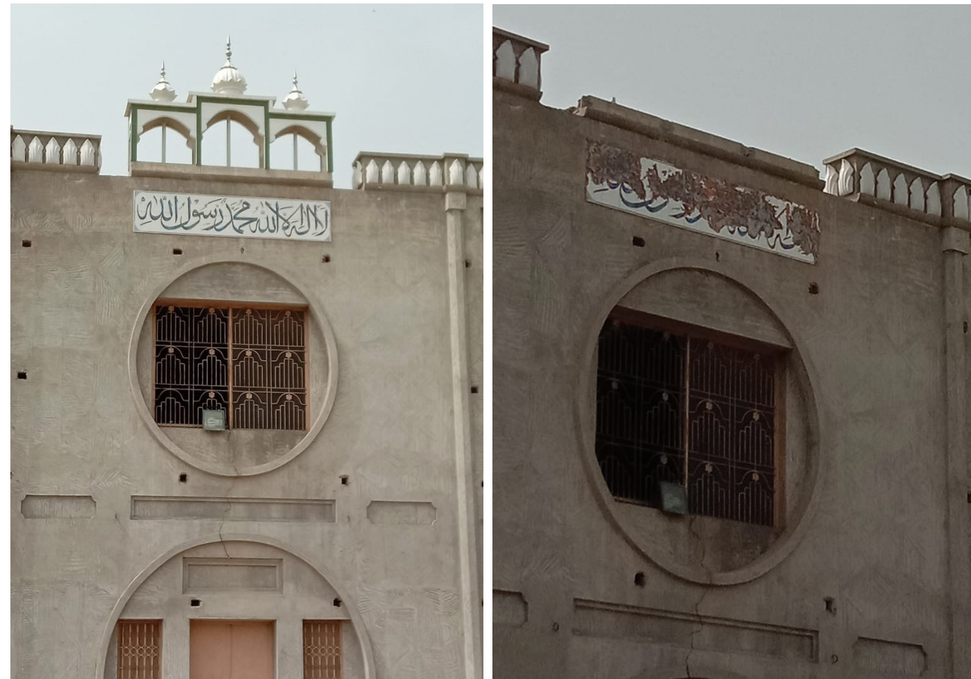
Images before and after the incident

As for the Kalima, the DSP insisted that Ahmadis remove it themselves. He was told that Ahmadis will not do that, but will not resist the police.