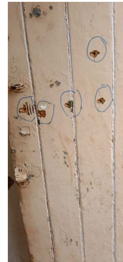
Images of gunshots