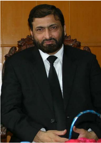
Chief Justice Lahore High Court Qasim Khan

Qasim Khan heard it and made the following observations: