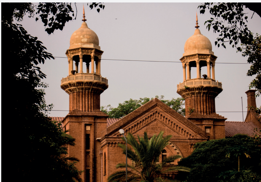
Lahore, October 2023:

It is significant that while there has been a multitude of attacks on Ahmadiyya places of worship and graves in recent years, this year has witnessed a quantum jump in such violations. More than 39 Ahmadiyya worship places and over a hundred graves have suffered attacks this year alone.