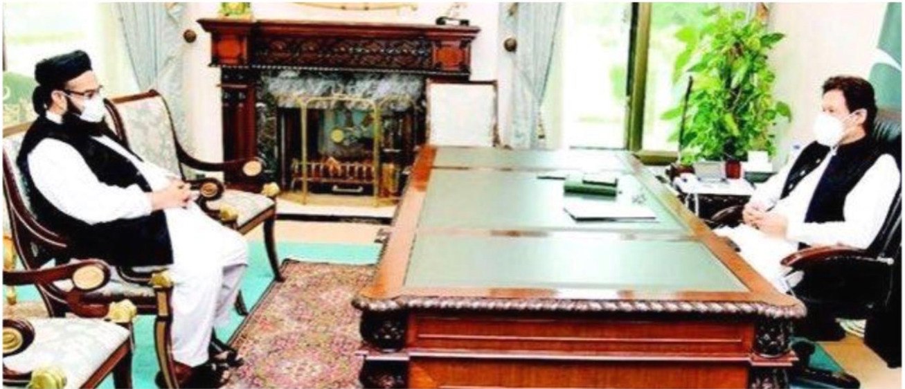
Islamabad: Molvi Tahir Mehmood Ashrafi meeting PM Pakistan Mr. Imran Khan in his office