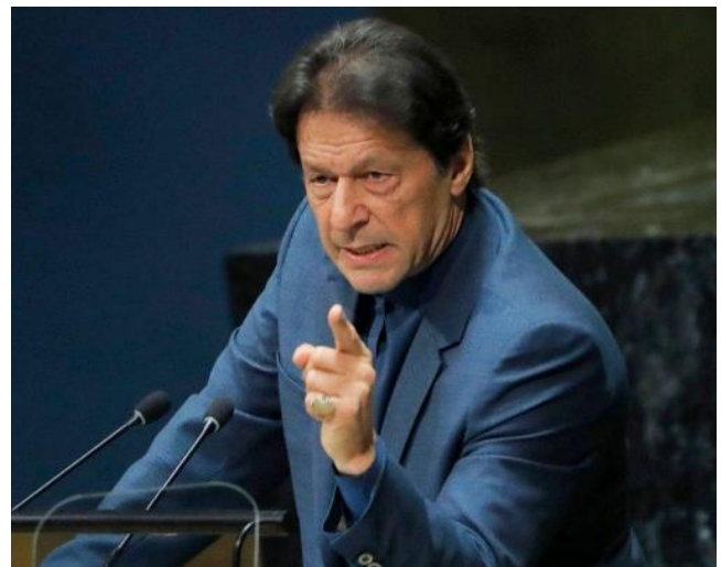
Mr. Imran Khan, PM Pakistan

The daily Express Tribune of October 2, 2020