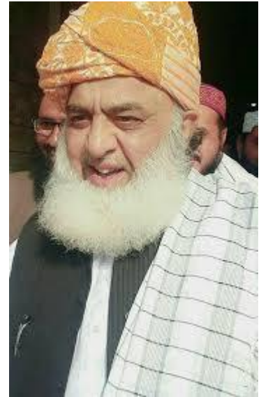
Maulvi Fazlur Rahman, JUI-F

Mulla Fazl ur Rahman remains deprived of political power, so he seems to attempt a big wave through religious issues to ride it to his