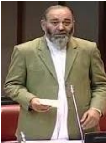
Senator Mushtaq Ahmad Khan, JI

Peshawar; September 6, 2020: Jamaat Islami is one of the leading religio-political parties in Pakistan. It has some appeal with average middle-class Islamists. Its founder, Maududi, had a convincing style for pseudo-intellectuals and run-of-the-mill Sunni Muslims. It poses occasionally to be rationalist, tolerant, and even progressive. In the past, it registered a few non-Muslims as members. However, it remains essentially an extremist, medieval, anachronistic party, committed to promote harsh and extremist understanding of Islam whom it occasionally calls a religion of peace and tolerance.