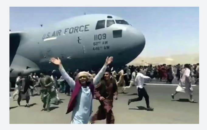
Desperate Afghans clinging to US plane amid chaotic scenes at Kabul airport