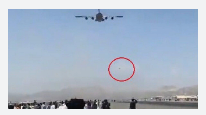
A man falling from a plane who tried to stow away in the undercarriage of an aircraft