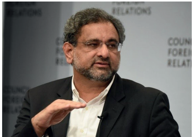
Mr. Khaqan Abbasi

But, the question remains: Do the Pakistani society and state have the wisdom, strength and courage to make portentous changes to the national direction?