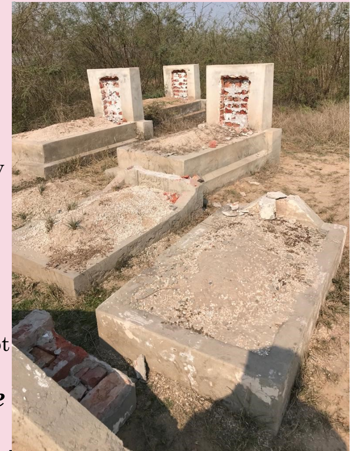
Gravestones desecrated by police in Chak 565 GB, Jaranwala, District Faisalabad

So, on February 3, after sunset, the police arrived accompanied by some local non-Ahmadi. They tore down 25 tombstones and took these away with them.